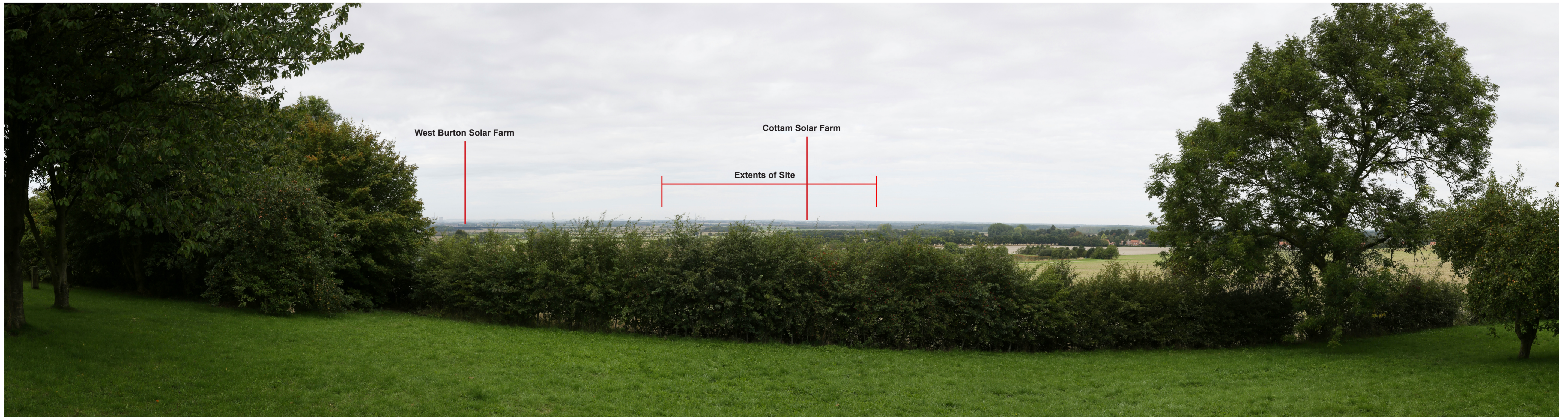
Proposed View Cumulative view Distance to Nearest Order Limits 9600m