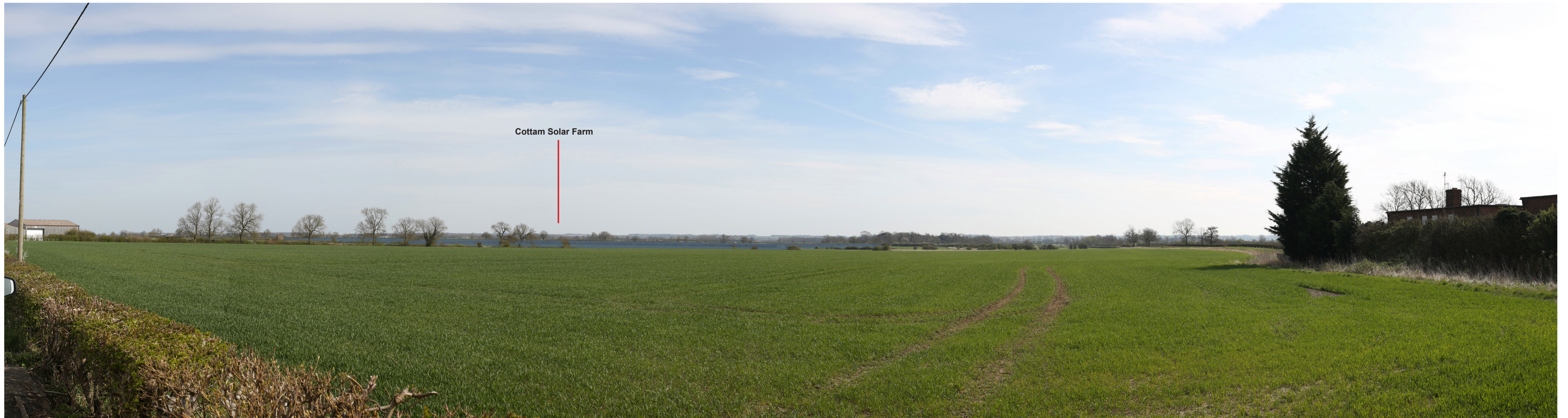
Proposed View Cumulative view

Viewpoint C3-2 View east / northeast from B1241 south of Normanby by Stow